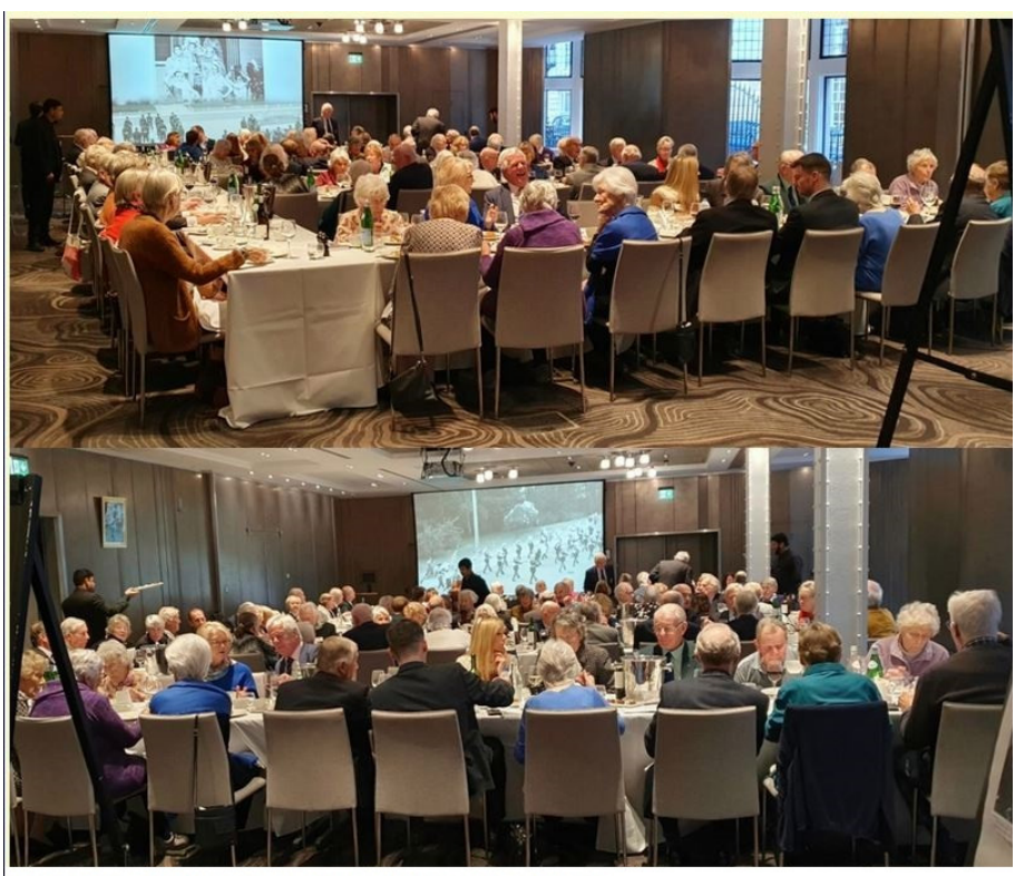
Enjoying the lunch and watching memories!