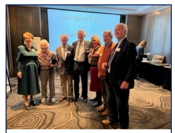
Founder members of the Wyvern Club