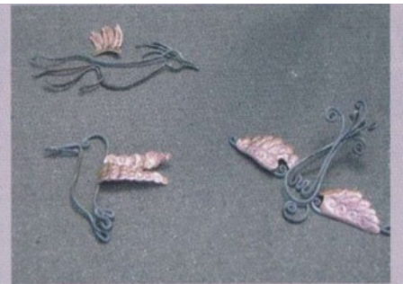
Carefully crafted metal birds