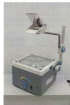
Overhead Projector 1980s

The BBC Archimedes Acorn was the computer that the teachers used in the 1980s, it was very weak with only 1MB RAM and about 20MB hard drive space which you could only download about 100 songs or be able to store about 200 photos!!! I know barely anything. But you can add floppy disks to the PC to add more storage to it. Whilst the DELL Optiplex 7010 is by far a stronger PC with about 6GB RAM and 7.78GB Hard Drive Space.