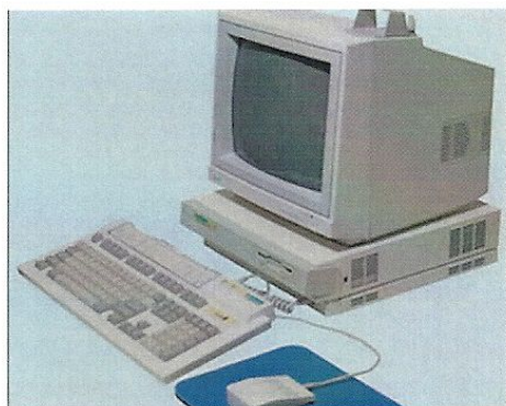
The BBC Archimedes Acorn (PC1980s)

Technology has changed a lot throughout the years since 1974 in John Buchan School. There has been a lot of innovation in tech; it has gone through many discoveries since the 1970s.